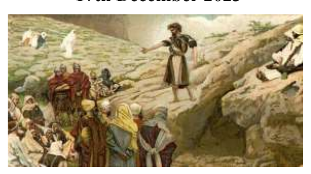
"Rejoice! The Lord is in your midst!

How would we answer someone who asked us, "Who are you?" Would we identify ourselves as being anointed by the Lord to bring glad tidings to the poor and to heal the broken hearted? Who we are is what we do.